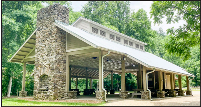
Pavilion at the Byron Herbert Reece Farm & Heritage Center

Reece farm is excited to host numerous NEW programs such as a fall music festival, family pumpkin patch,