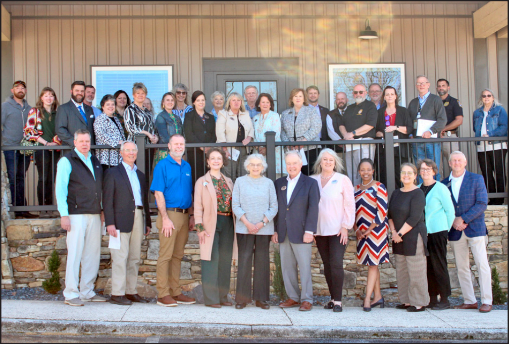
Area stakeholders celebrated the completion of renovations at the Shirley Miller Adult Education Center last week with a ribbon-cutting ceremony by the Blairsville-Union County Chamber of Commerce.